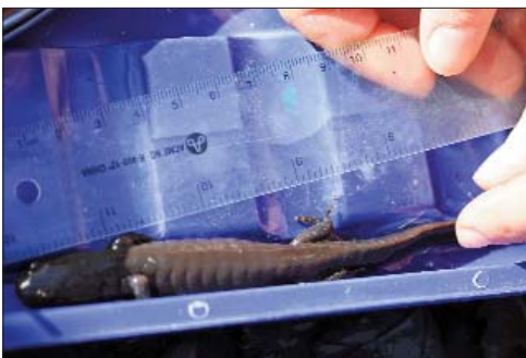
A researcher measuring a salamander. Monitoring is an important step in finding solutions.

Some municipalities have also implemented solutions such as reducing speed limits, posting turtle crossing signs, temporary road closures, as well as public education. For example, in recent years, the spring migration of Jefferson salamanders has sparked a temporary closure of Stauffer Drive in Kitchener. In this case, the closure was required by the MNRF, which oversees the endangered species legislation. Jefferson salamanders are one of many species that are protected under Ontario's Endangered Species Act, because their population is in decline.