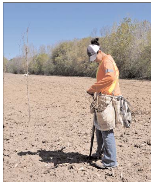
The GRCA arranges to have planting done on private land.

For more information, to order trees and to view the tree availability list, visit the forestry section of the GRCA website at www.grandriver.ca/Trees .