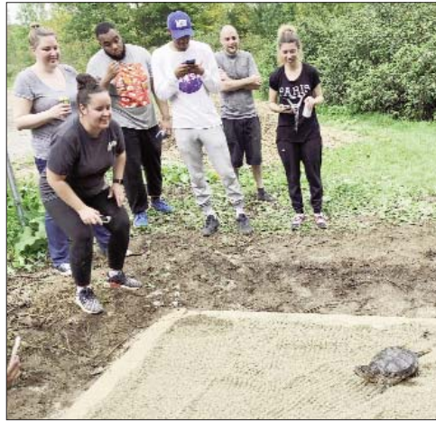
Snappy is a “teacher creature” at Laurel Creek Nature Centre and she tested out the new site as it was being completed.

Turtle nest cover signs were made by students.