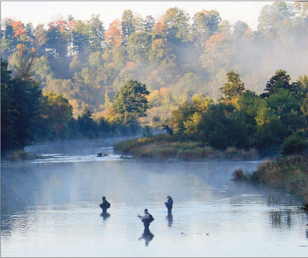
Anglers provided a lot of input into the fish plan.