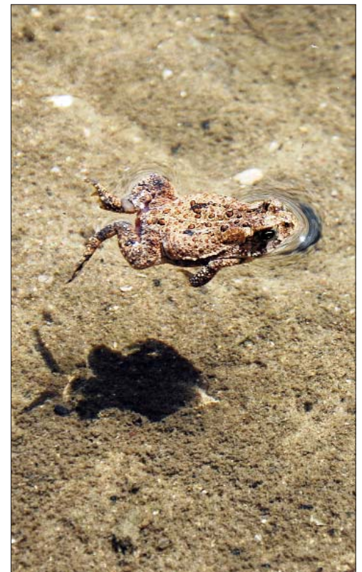
Species such as the American toad are common and widespread in our watershed.

More than 300 native birds have been observed in the watershed, but there are only 43 native reptiles and amphibians, so it’s easier to complete a herp list than a bird list. The word herpetofauna comes from the Greek word herpetos, which means crawling.